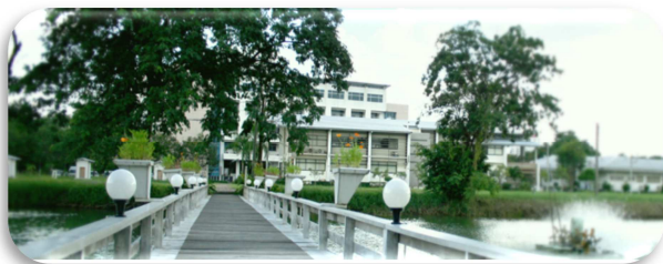
Kasetsart University, a nice green working environment